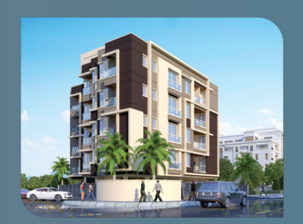
Three Side Open